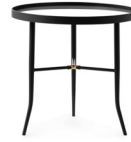
Lug Table Small