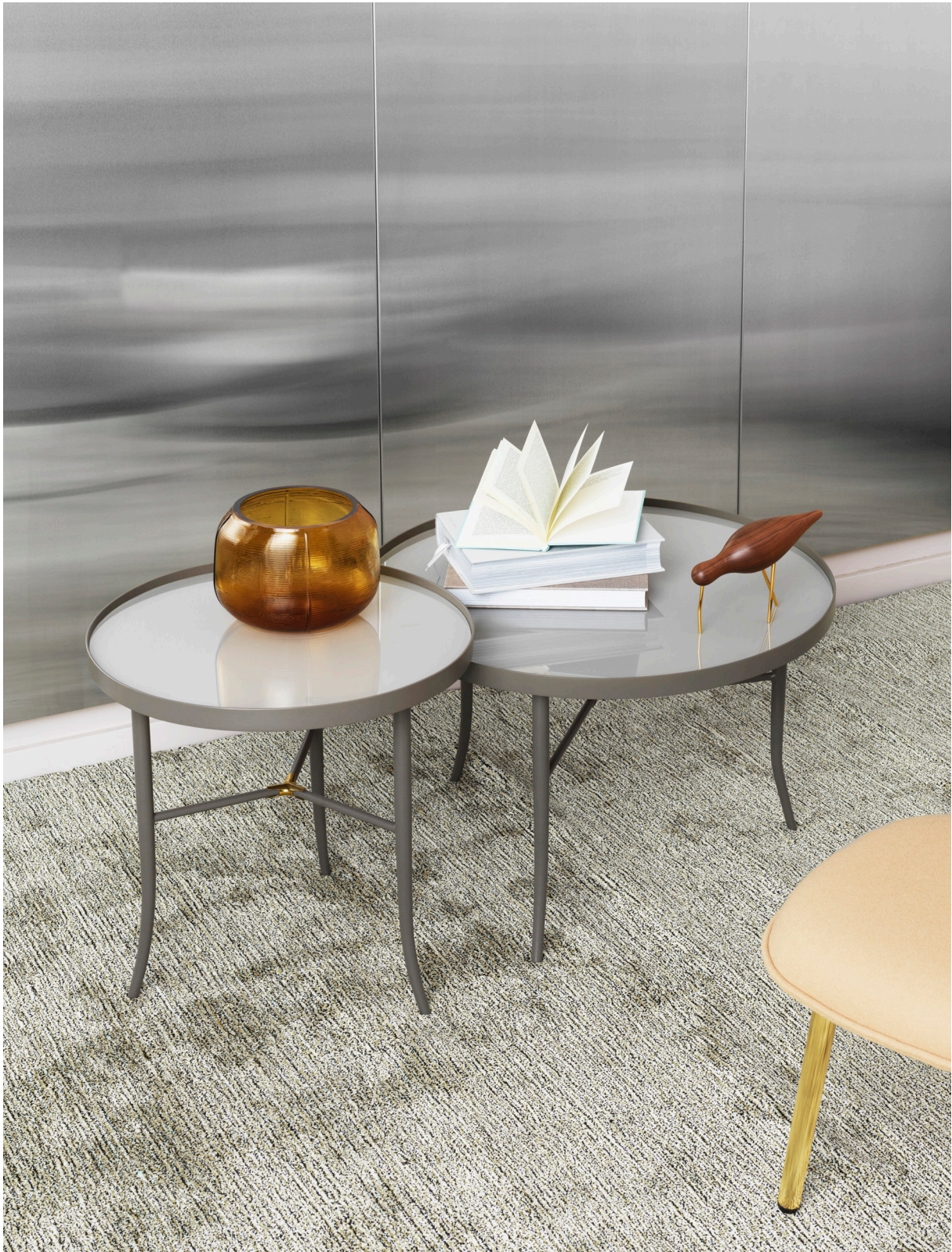
Lug table small and large in gray