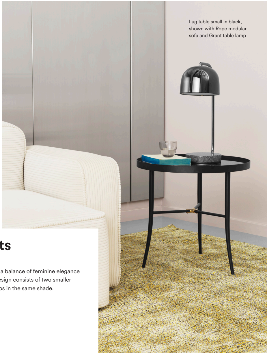
Lug table small in black, shown with Rope modular sofa and Grant table lamp