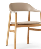
Herit armchair upholstery

H: 81,5 x L: 60 x D: 51 x SH: 45 x AR: 66,5-77 cm